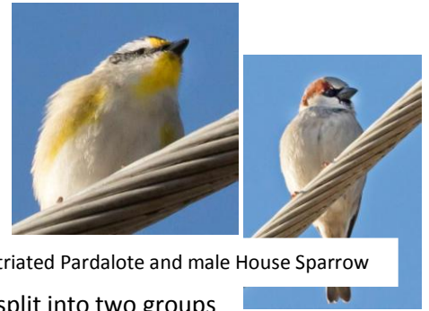
Striated Pardalote and male House Sparrow