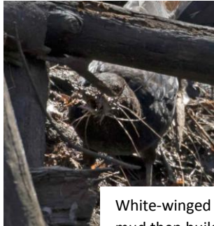
White-winged Chough collecting twigs, dipping in mud then building their communal nest.