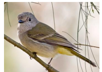
Female Golden Whistler showing the northern lemon wash under tail