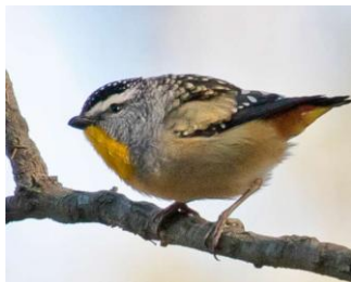
Spotted Pardalote and Varied Sittella