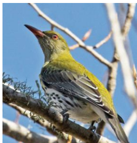
Olive-backed Oriole - note vivid colouring on back

photographers alike. Their co-operative nest-building activity gave rise to discussions about the organisational abilities of birds that enabled them to work together so industriously and co-operatively.