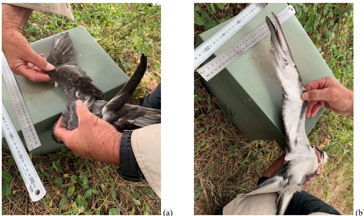
Figure 2. The Pycroft's Petrel after its temporary removal from an artificial nest box on Broughton Island on 26 October 2019: (a) upper wing (b) underwing.

In Table 1 we compare the relevant biometric information for the Broughton Island bird with the five contender species. Gould's Petrel, Cook's Petrel and De Filippi's Petrel could be eliminated by the wing measurement. Additionally, the ratio of wing length to bill length based upon the published biometric data for Cook's Petrel and Pycroft's Petrel