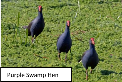
Purple Swamp Hen

Pioneer Dairy (or Central Coast Wetland) is between Wyong and Tuggerah. It has a freshwater lake which is approximately 400 metres x 150 metres. There are also small swamp and creek bed areas. The surrounding paddocks that we access are approximately 15 hectares with forested fringes. A total of 67 species were recorded, rather good for this time of year.