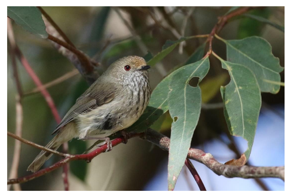
Brown Thornbill