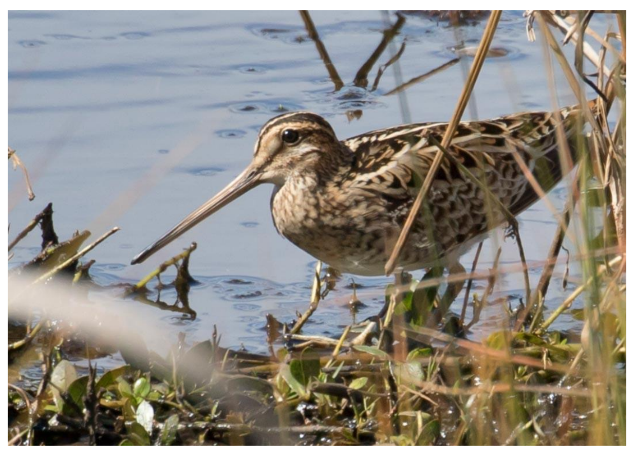
Latham's Snipe