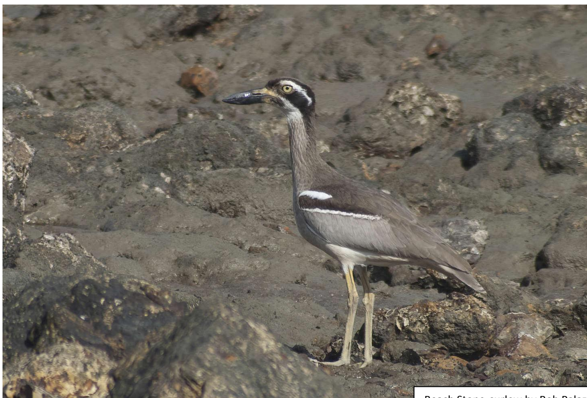
Beach Stone-curlew by Rob Palazzi

The Club Aims: To encourage and further the study and conservation of Australian birds and their habitat, and to encourage bird observing as a leisure-time activity.