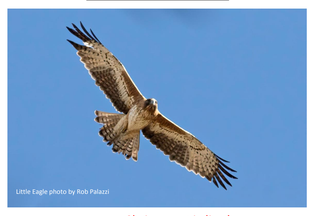
Happy Christmas Birding!