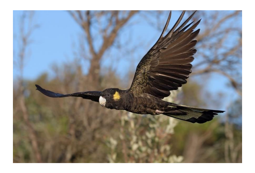
Yellow-tailed Black-Cockatoo