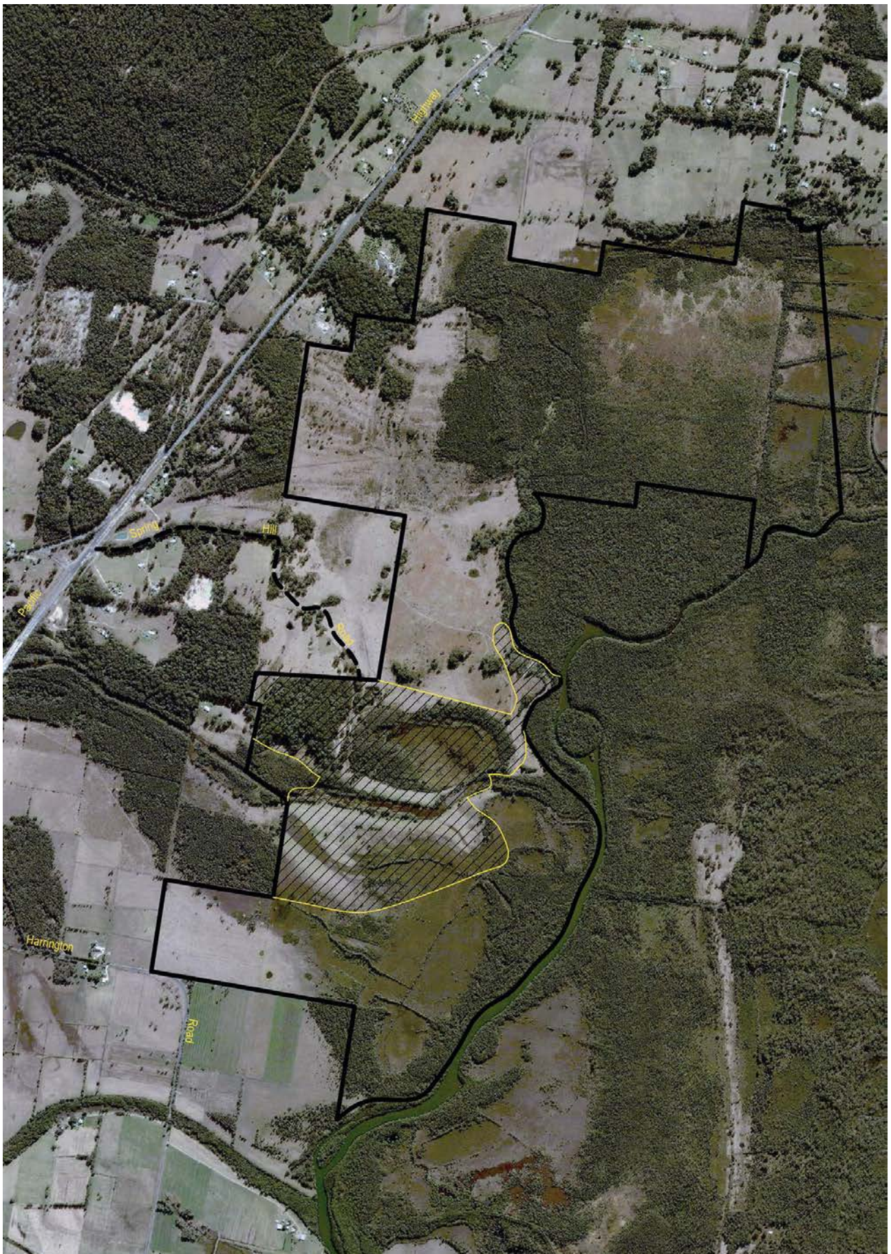
Figure 1. Location of areas surveyed (hatched) within the whole Cattai Wetlands parcel (black outline). Aerial image courtesy of Greater Taree City Council.