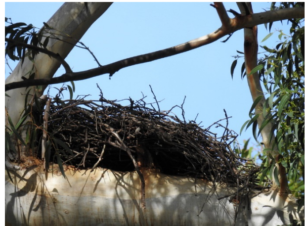
Figure 1. The 2016 Brahminy Kite nest, Lemon Tree Passage.

Between 28 May and 8 July (41 days) stick-carrying was observed daily, more frequently in the morning, until nest completion. On at least three occasions both adults were observed carrying sticks at the same time. The female was rarely seen flying after mid-June, but the male continued to carry sticks.