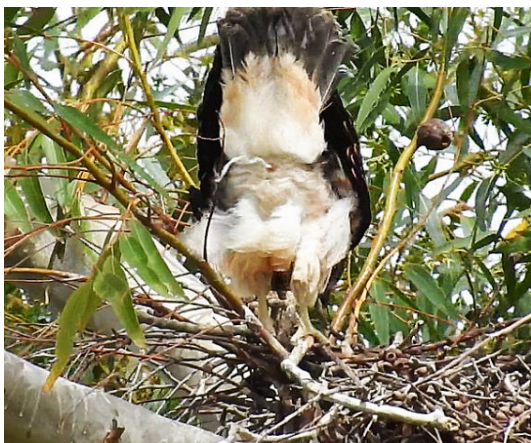
Figure 4. Nestling Brahminy Kite defecating off nest (30 days old).

On 21 August the female began making frequent position adjustments and bill-poking her lower chest area. Hatch was assumed. Feeding behaviour was observed on 22 August, and the juvenile's down-covered head was first seen 12 days post-hatch. At 20 days post-hatch emerging feathers were visible on the neck, wings and body, and the juvenile was seen attempting to feed itself. At 38 days the feather pattern was well defined, and when not sleeping or eating the juvenile was constantly engaged in preening, wing flapping and wing stretching. At 30 days post-hatch, the juvenile began perching backwards on the nest rim in order to defecate over the side of the nest ( Figure 4 ). Between 46 days and fledging, play-type behaviour involving leaf-tugging and branch-pulling was occasionally seen. Small sticks, gradually loosened from the nest structure, were sometimes tossed in the air, and a few were dropped over the side of the nest and watched as they fell. Near fledging, the nestling jumped on the nest frequently; while jumping, forward rotation of the wing and shoulder joint was obvious ( Figure 5 ).