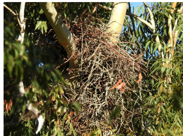
Figure 2. The 2017 Brahminy Kite nest, Lemon Tree Passage.

Nest-building material was mainly sourced from Bulls Island Nature Reserve, a strip of land covered in Grey Mangroves Avicennia marina and Swamp Sheoak Casuarina glauca (identified from Cronin 2002), which forms the east side of the narrow strait known as Lemon Tree Passage. Stick-carrying was mostly observed from Site 1 ( Figure 3 ). The adult male carried sticks in the bill, not the talons, and was frequently mobbed by 40-50 Little Corellas Cacatua sanguinea , but no sticks were dropped.