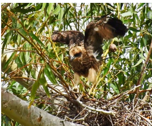
Figure 5. Nestling Brahminy Kite jumping on nest (40 days old).

On 9 October the juvenile was found off the nest and hopping to branches in the nest tree. On 10 October (50 days post-hatch) the juvenile began making short flights to neighbouring trees. The juvenile's first flights above the canopy were strong, but repeated landing attempts on top of the canopy resulted in crashes and tumbles. Landing had improved by the following day, when the juvenile was observed landing on solid, stable branches.