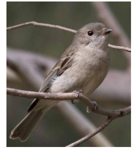
Rose Robin (left) Female Golden Whistler (right)

The bird list reached a healthy 75 species for the weekend. We had some fully flowering Eucalypts next to the camp site so anyone who did not want to walk too far could sit