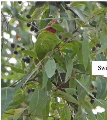
Swift Parrot (left)