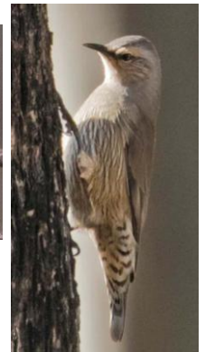
Clockwise from top left: Spotted Pardalote, Silvereye, Brown Treecreeper, Brown Thornbill, Superb Fairywren, Speckled Warbler, Red-browed Finch.