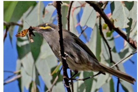
Yellow-tufted, White-cheeked, Fuscous, Yellow-faced, White-naped honeyeaters.

A small group of Sitella worked their way through the rough-barked trees round the camp, along with some old faithfuls like Speckled Warbler, Jacky W, Golden Whistler, etc. Delightful, without the need to venture very far.