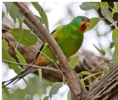
Clockwise from top left: Varied Sitella, Crested Shrike-tit, Fuscous Honeyeater, Eastern Spinebill, Rose Robin, Brown Thornbill, Eastern Yellow Robin, Swift Parrot.