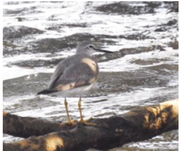
Photo: Grey-tailed Tattler

We first walked along to the Fern Bay bank where the Grey-tailed Tattlers roost, and found them along with 3 Terek Sandpipers, 1 Common Sandpiper and Whimbrels. Some of these were in the lone mangrove where they gather if disturbed under the bank. We returned to the bridge area and walked the path to the shore so that we could observe the hundreds of Pacific Golden Plover, heads poking up out of the vegetation. They had some Curlew Sandpipers and many Sharp-tailed Sandpipers with them.