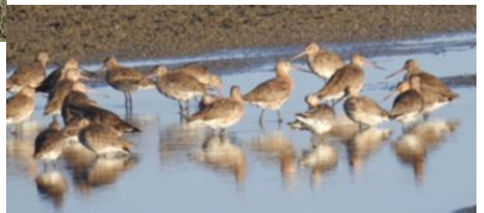
Photo: Bar-tailed Godwit

Further over standing in water were Red-necked Avocets, Black-winged Stilts Bar-tailed Godwits and Eastern Curlew.