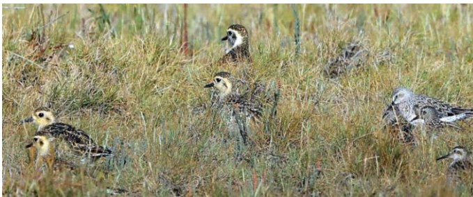
Photo: Pacific Golden Plover and others

Further over standing in water were Red-necked Avocets, Black-winged Stilts Bar-tailed Godwits and Eastern Curlew.