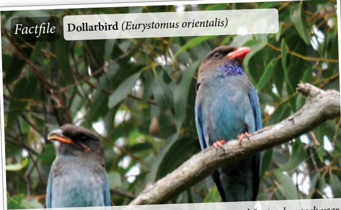
This migratory bird arrives in Eastern Australia around September each year. It prefers open woodland areas and feeds mostly on flying insects. They can often be seen sat on a conspicuous perch in wait for passing prey. Males and females are similar in colour although females are slightly duller.

To the north of Murrurundi are the townships of Quirindi and Wallabadah. At both, there are signposted birding routes directing you to the local sites where birds can be found. These routes were developed by the Tamworth Bird Watchers Group.